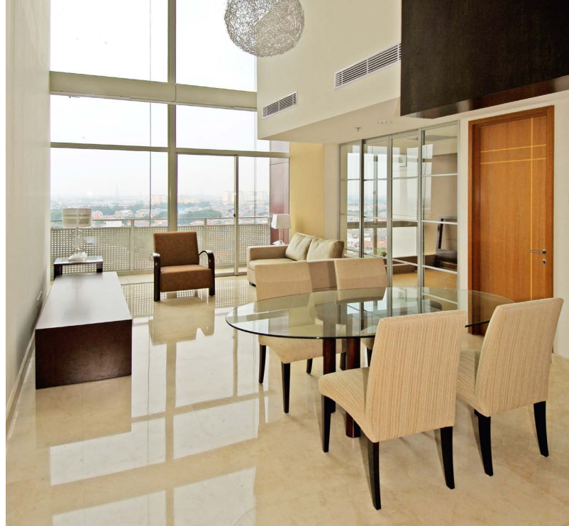
Interior of one of the apartments

The scope of work included a reinforced in-situ concrete structure on piled foundations with shear walls, columns and slabs. Precast elements were used for building end walls and staircases. The internal walls were built of lightweight concrete blocks.